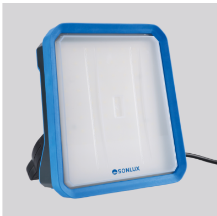
Compact lights 4017506084652 L 320, B 305, H 110